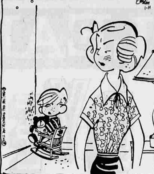
"DON'T TELL MARGARET! SHE KEEPS CALLIN' ME 'LITTLE JACK HORNER!'"