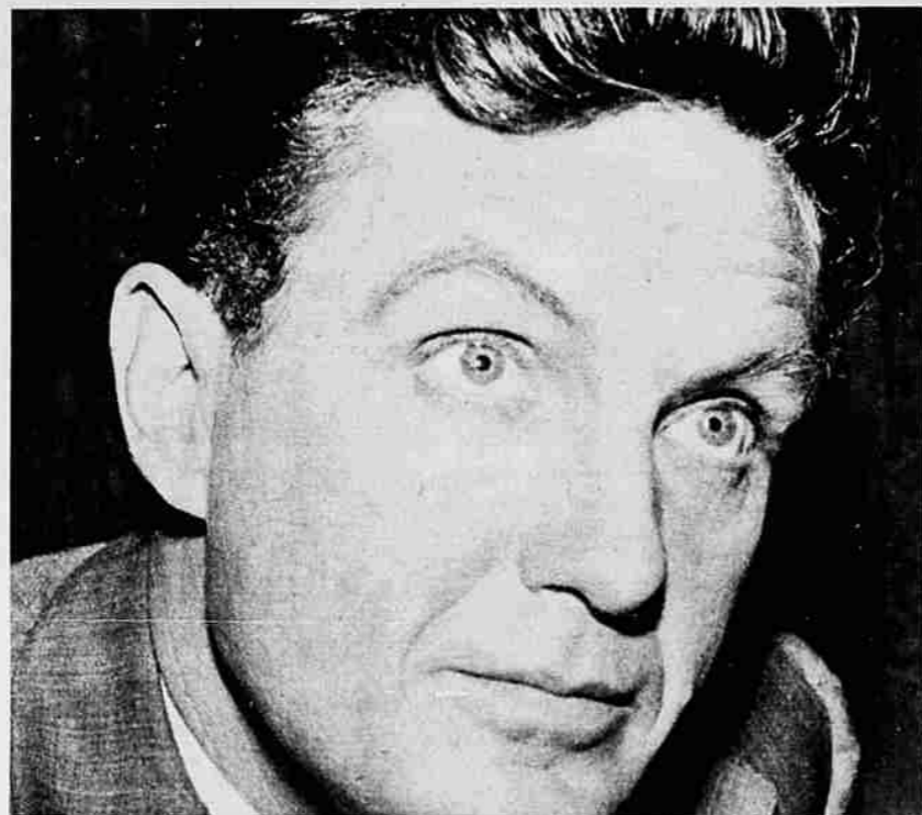
Ex-heir to a fortune, talented Robert Stack has begun to reap his own financial rewards.

Once tabbed a glamour boy and perennial bachelor, he's now