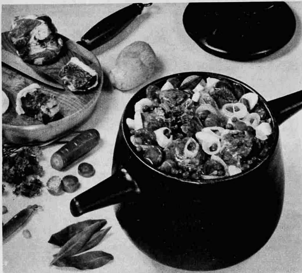
This stew is flavored with a pleasing combination of herbs and lemon to highlight the lamb and vegetables.