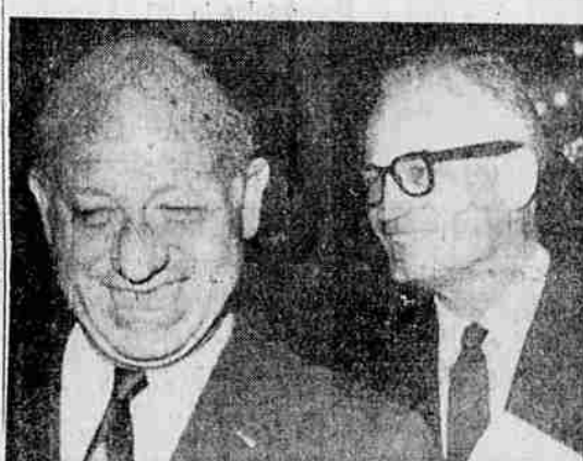
CAMPAIGN CHAIRMAN —The Senate Republicans have unanimously renamed Sen. Barry Goldwater (Ariz.) as their campaign chairman after an "air-cleaning" exchange between Goldwater and Sen. Jacob K. Javits (N.Y.). Javits, left, and Goldwater are shown as they left the GOP conference in Washington today.

carried several members of the U.S. Embassy staff from Havana, closed when the U.S. severed diplomatic relations with the Castro government Wednesday.