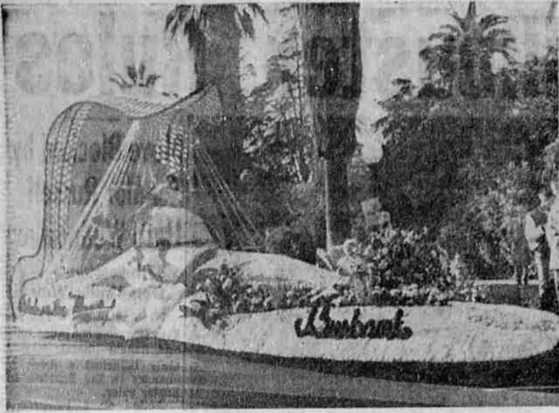
SWEETSTAKES WINNER —Orchids in the Moonlight is the title of the float entered by the City of Burbank which was named the sweepstakes winner of the Tournament of Roses parade at Pasadena, Calif., Monday. The entry embraces a floral shape featuring a cantilevered petal-like canopy.