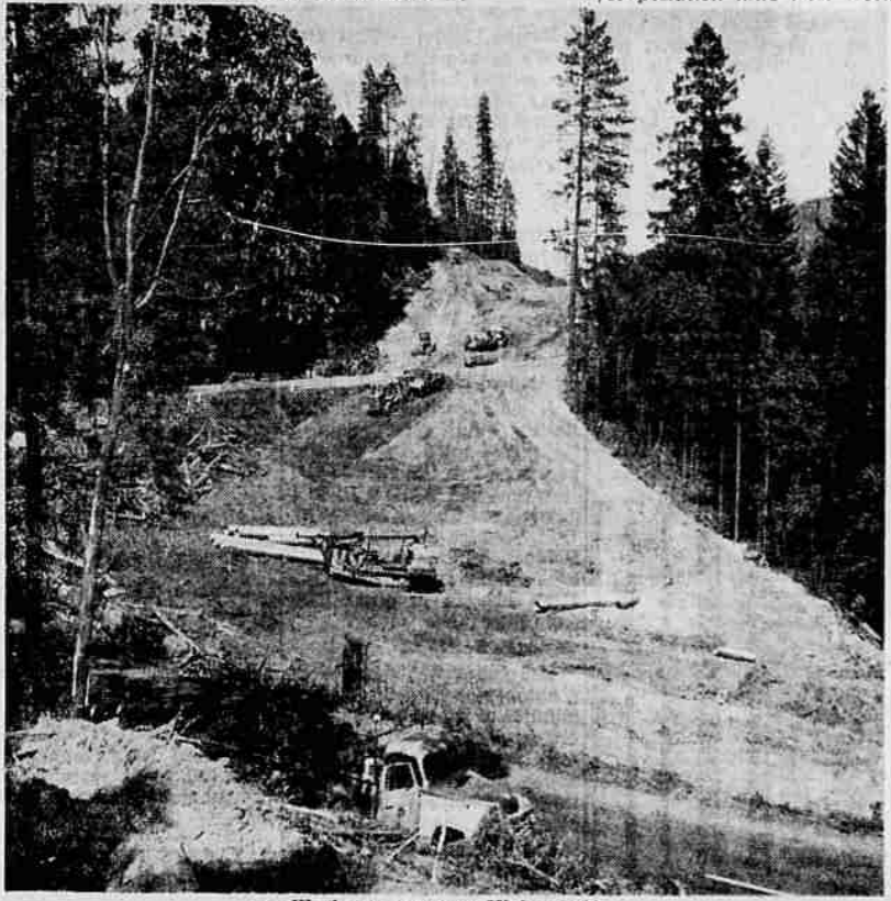
Work progresses on Highway 82