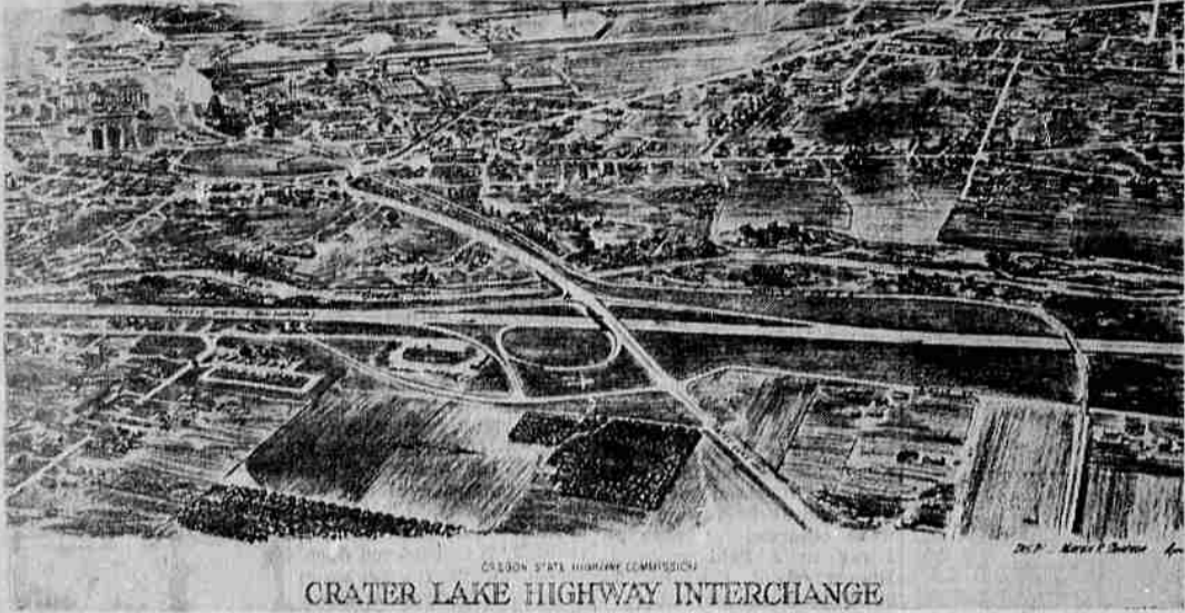
CRATER LAKE HIGHWAY INTERCHANGE ... Work commences on freeway in Medford ...