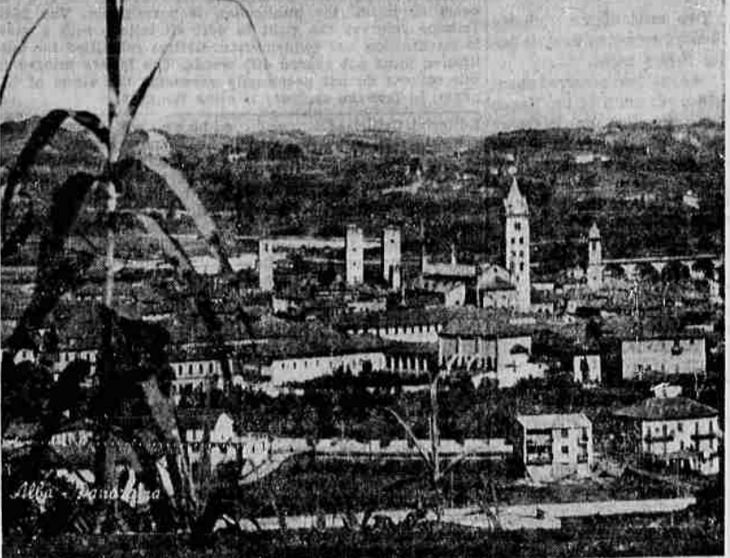
... Medford affiliates with Alba ...

Following is a month-by-month review of activities in the area during the past year.