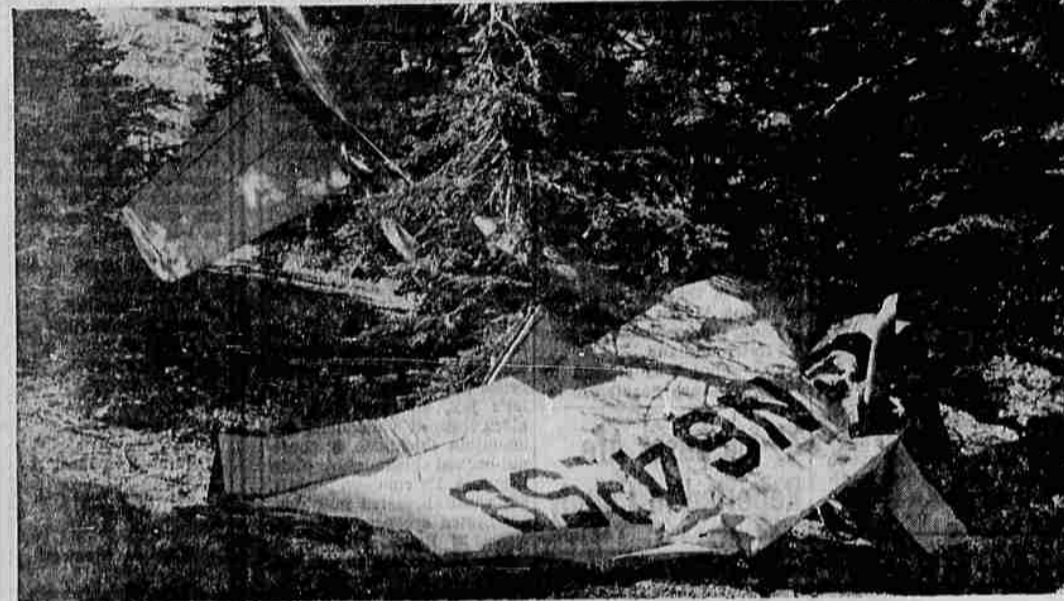
... Four bodies found at plane wreckage ...