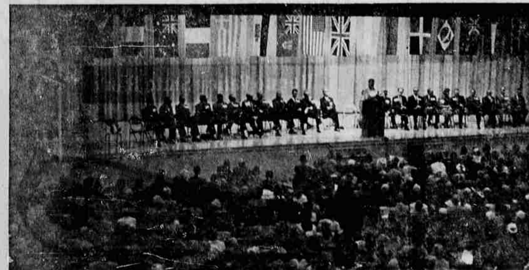
... Candidates' fair highlights political campaigning ...