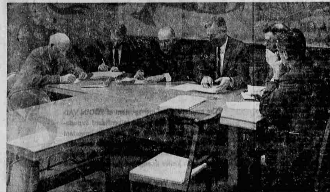
... Bids opened for $1.5 hospital wing ...