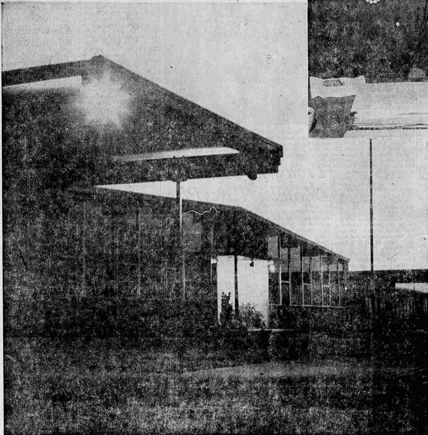
Wilson school, pictured here, will be the scene of an important meeting Thursday, January 5, as will all other public schools in Oregon. At the Wilson session, and all the others, Oregon citizens will hear rather discussion of such problems as how to finance Oregon's schools, how to raise professional standards for teachers, how to promote child welfare in general, how to promote highway safety as it concerns school children, how to improve administrative organization of schools, and scores of other pertinent questions and problems.