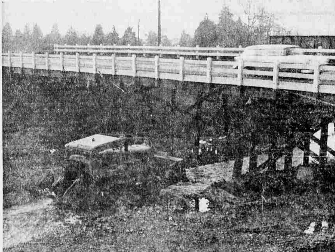
CONSTRUCTION AREA —The Crater Lake highway over Bear creek, above, is soon to be removed and replaced with an elevated structure that will form part of the overcrossing on the new freeway. Currently under construction is a detour and temporary bridge that will take traffic off the present bridge while the work is being done. The tractor (compare its size with that of the car on the bridge) is using the creek bed as a route to another construction site instead of crossing the highway. Completion date for the Seven Oaks-Jackson st. section is tentatively set for May 1, 1962, according to A. A. Anderson, engineer for the state highway construction office here.

The Bureau of Reclamation will retain responsibility for operation and maintenance of the 18,000-kilowatt capacity Green Springs power plant.