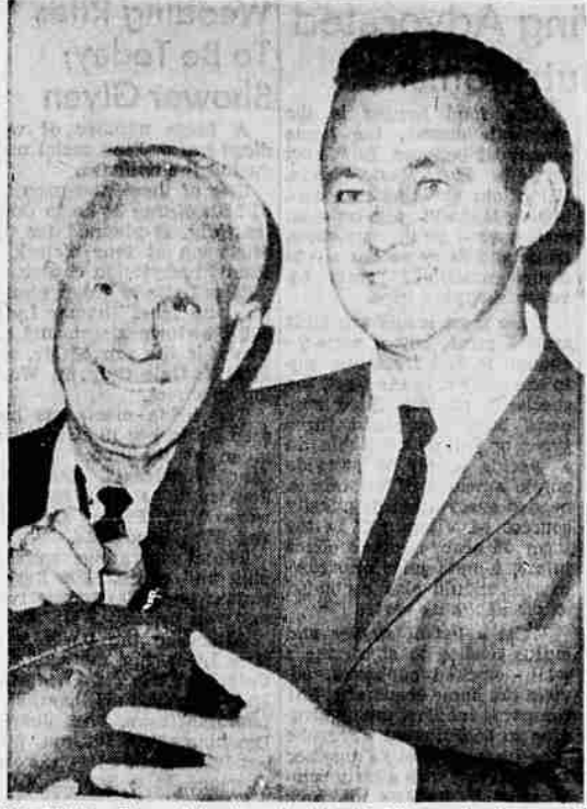
RETIREE—Two of the happiest "retired" men in the world autograph a fan's football after the Philadelphia Eagles 17-13 victory over Green Bay for the National Football league championship. They are Eagle Coach Buck Shaw, left, and quarterback Norm Van Brocklin, who called the game and passed the team to victory. They announced their retirements from pro football after the game.