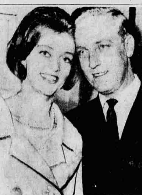
Princess Birgitta of Sweden and her fiancé, Prince Johann Georg of Hohenzollern-Sigmaringen appeared at an official press conference in Stockholm Friday. A court communique announced their engagement the previous day, but mentioned no date for the wedding. The German prince met Birgitta last winter when she visited Germany.