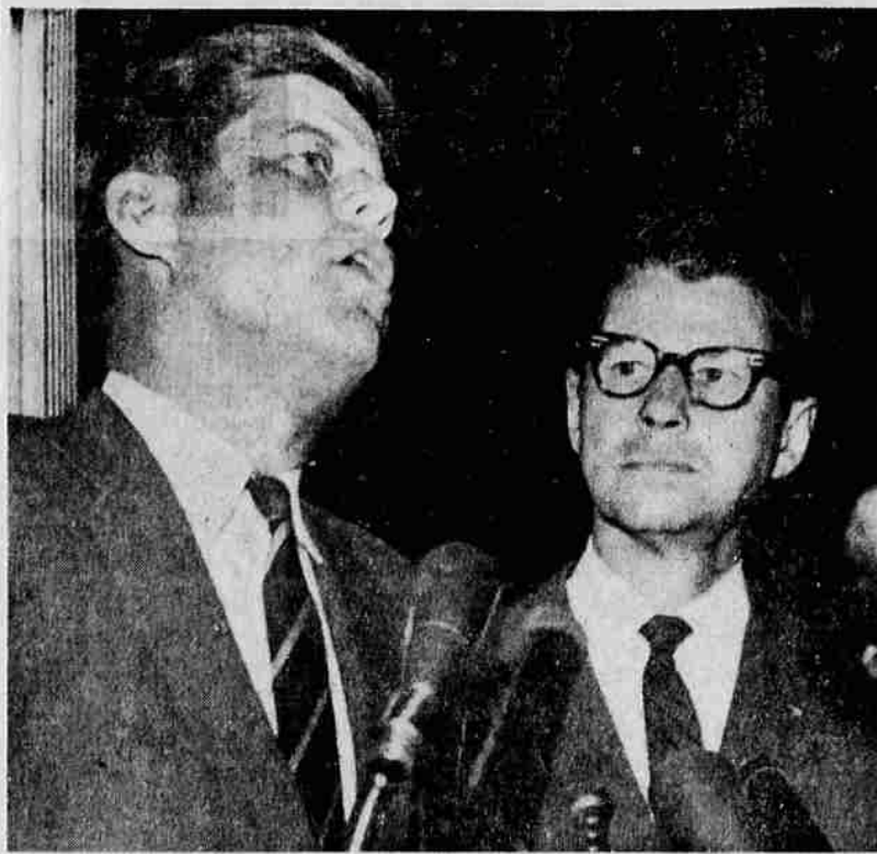
AGRICULTURE SECRETARY — President-elect John F. Kennedy is shown as he has appointed Minnesota Gov. Orville Freeman, right, secretary of agriculture in announced to newsmen late Thursday that his administration.

Utah's state tree is the blue spruce, the sea gull the state bird and the Sego lily the state flower.