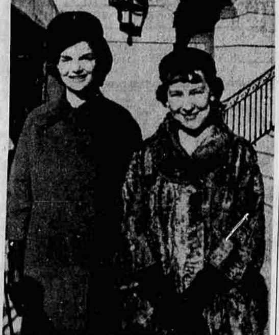
Mrs. Dwight Eisenhower and Mrs. John F. Kennedy paused in the South Grounds after the first lady took the future first lady on a surprise tour of the executive mansion Friday. Mrs. Kennedy went to the White House within two hours after she left Georgetown hospital with her infant son.