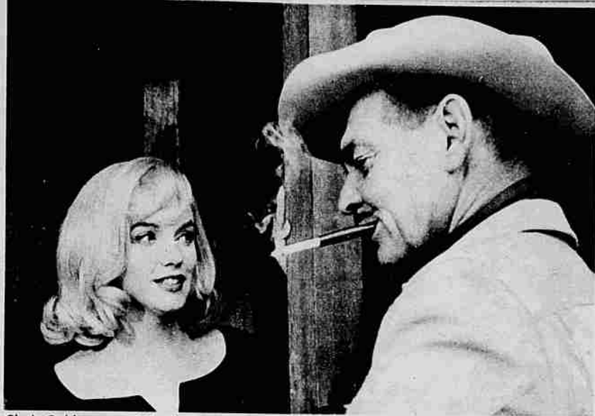
Clark Gable exposed Marilyn to his special brand of charm in a scene from "The Misfits."