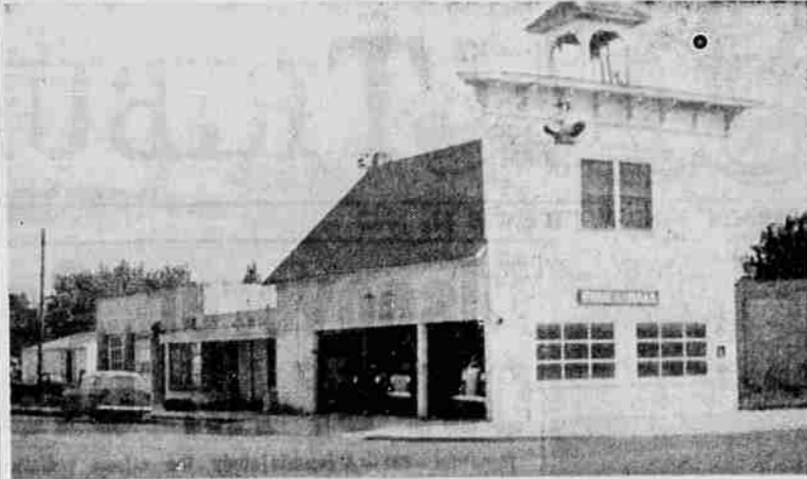
OLD FIRE HALL - The old fire hall in Central Point has been torn down and replaced by a new city hall. The old fire hall was a familiar sight on Central Point's main street for a number of years. The fire department was moved to a new building constructed in 1956, which now adjoins the new city hall.

With official returns in from 38 states, and complete but unofficial results reported from the other 12, this was the United Press International tabulation: Kennedy - 34,203,022 (49.734 per cent) Nixon - 34,083,912 (49.561 per cent) Others - 484,869 (0.705 per cent) Total - 68,771,803 Kennedy had 50,087,212 per cent of the 68,286,934 two-party vote and Nixon had 49,912,799 per cent - a difference of 0.17442 per cent.