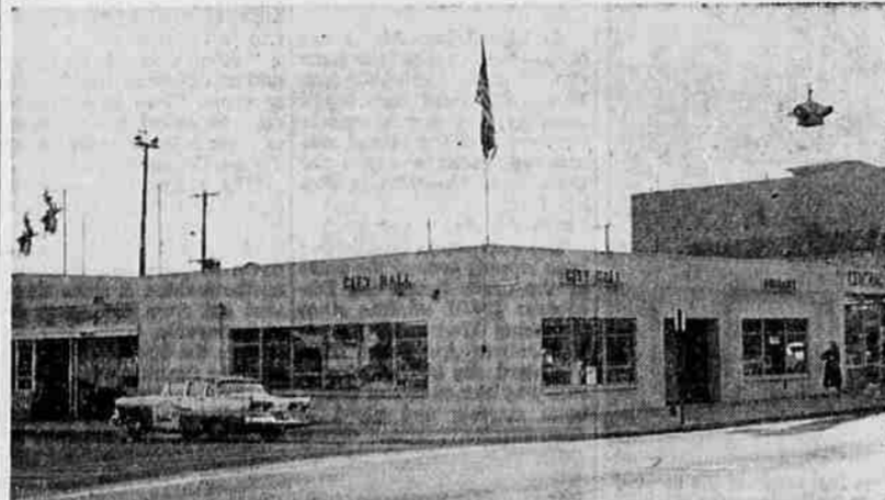
NEW CITY HALL - Central Point city officials have moved to their new offices in Saturday at an open house. City officials the modern city hall recently completed. The $14,444 building includes facilities for the city library. It was officially dedicated Saturday at an open house. City officials conducted guided tours through the building.