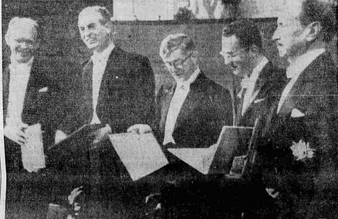
AWARDS COLLECTED—Nobel Prize winners of 1960 pose with their awards after ceremonies at Stockholm Saturday. Shown with their prizes are, from left, Willard Libby of the United States, winner of the chemistry award; Professor Peter Brian Medawar of Britain, and Sir Frank MacFarlane Burnett of Australia, co-winners of the award for medicine; Donald A. Glaser, of the United States, winner of the physics award, and St. John Perse of France, winner of the literature award.