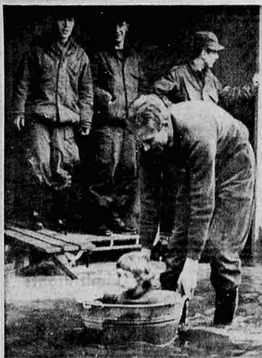
WASHTUB BOAT —With heavy rains causing flooding in several parts The Netherlands, a little girl turns a wash tub into a boat, and is pushed along by her father in Amsterdam Monday.