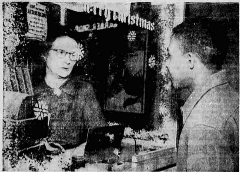
DEMONSTRATION—A four-hour-long demonstration by University of Texas students, urging integration of movie houses near the campus at Austin, was held Monday. More than 200 students, both white and Negro, filed past the box office asking if "all their friends would be admitted to the movie. An unidentified Negro boy is being turned away.