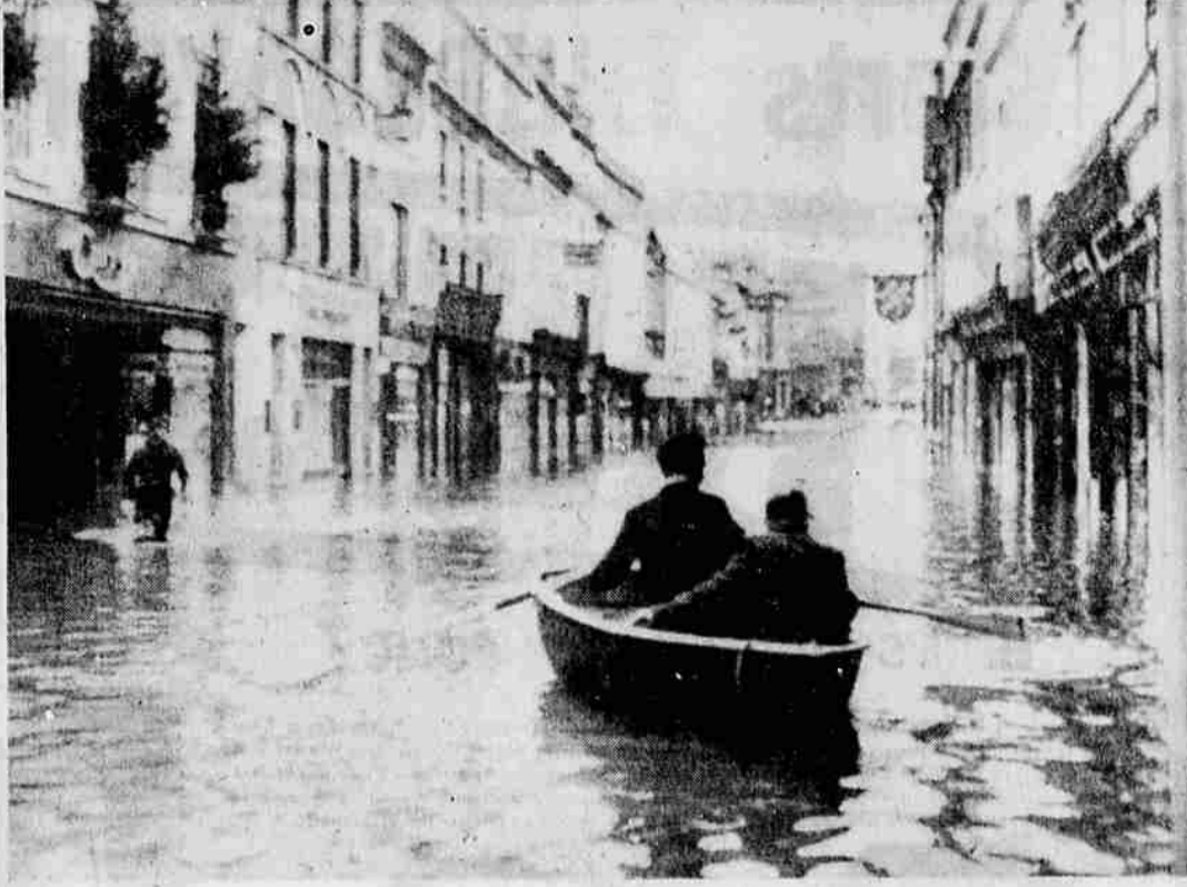
BATH ALL WET —As anyone can plainly see, Bath is all wet. The British resort city was inundated by floods following several days of continuous rain. Here, rescue workers set out in a rowboat to explore flooded Southgate st. in the center of the town. At left in background, a frogman wades through the water.

Salem—UPI—The Oregon Agriculture department announced today that an interior quarantine on pine stock in Oregon is not contemplated.