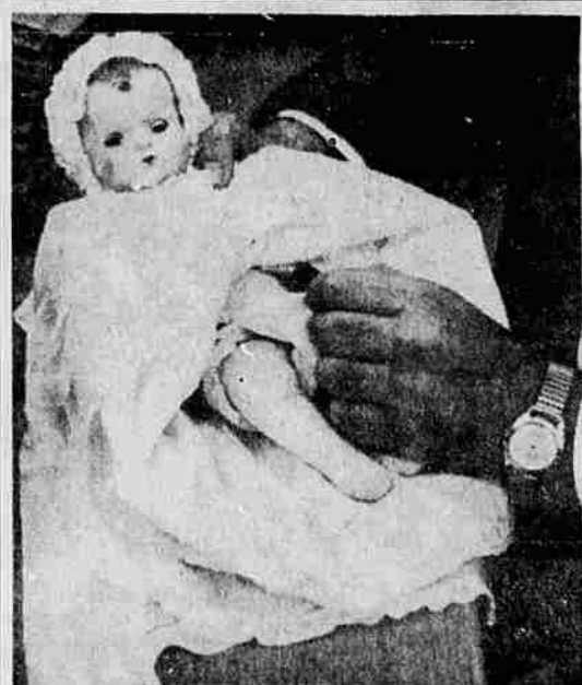
DOLL HIDES DRUGS —This blue-eyed blonde baby doll led to the arrest of a teen-age girl and two men at Belmont, Calif., on charges of possessing narcotics. Police, questioning the girl, found heroin pinned to the inside of the doll's panties. The girl implicated the men in further questioning.

Washington—(UPI)—Oregon's official 1960 population as of April 1 was 1,768,687, final figures showed today. That compares with 1,756,366 listed in the preliminary report last August. The 1960 figure is a gain of 247,246 over 1950, or 16.3 per cent. The state's largest city, Portland, had 372,876 in the final figures compared to 371,032 listed in the preliminary figures. Other top cities and their 1960 population include: Eugene 59,977; Salem 49,142; Medford 24,425; Corvallis 20,669; Springfield 19,616; Klamath Falls 16,949; Pendleton 14,434; Albany 12,926 and Bend 11,936. Other Oregon cities, listed alphabetically, include: Ashland 9,119; Baker 9,989; Beaverton 9,937; Coquille 4,730; Coos Bay 7,084; Dallas 5,072; Forest Grove 5,626; Grants Pass 10,118; Hermiston 4,402; Hillsboro 8,232; La Grande 9,014; Lebanon 5,858; McMinnville 7,656; Milwaukie 9,099; Newberg 4,204; Newport 5,344; North Bend 7,512; Ontario 5,101; Oregon City 7,996; Oswego 8,908; Roseburg 11,467; St. Helens 5,222; Tillamook 4,244.