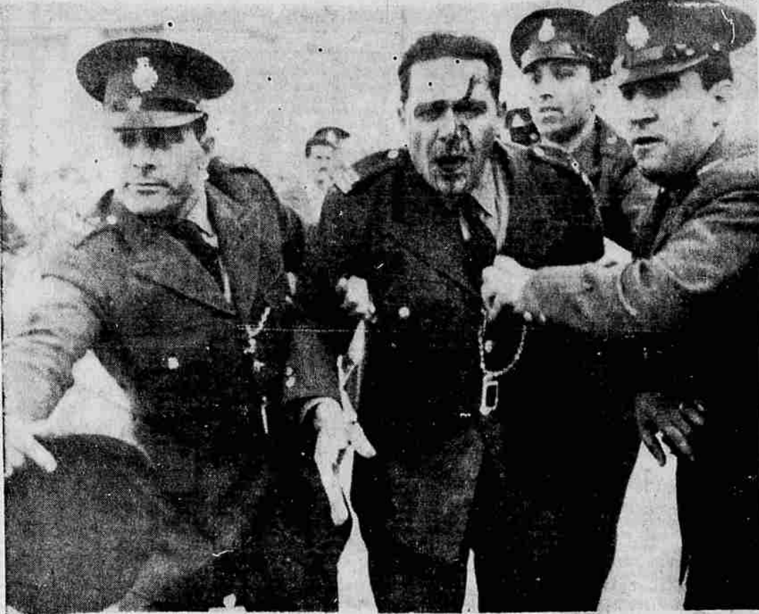
POLICEMAN INJURED —A bleeding policeman is lead away from a demonstration at Athens, Greece, by comrades after 5,000 building workers rioted in protest to a new social security law.

20 Pages MEDFORD, OREGON, MONDAY, DECEMBER 5, 1960 No. 222