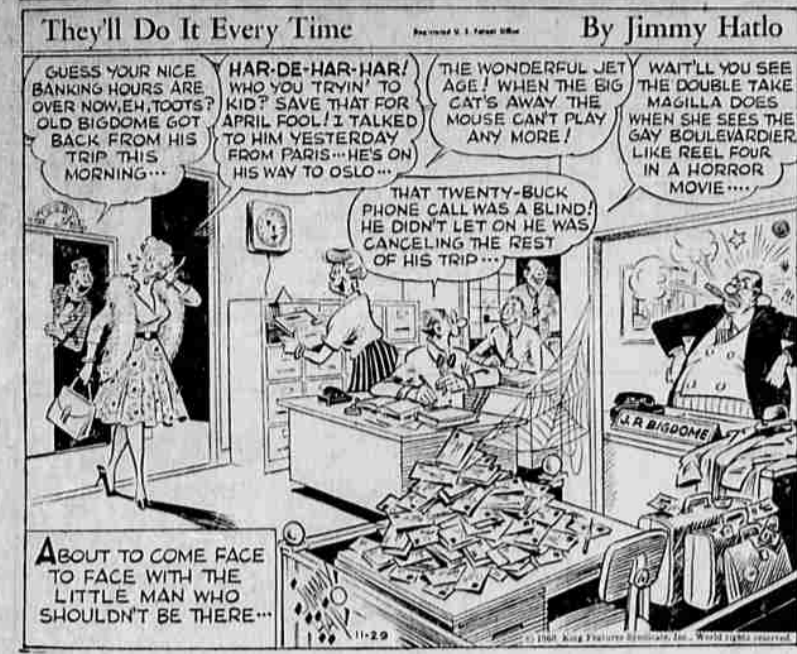
They'll Do It Every Time By Jimmy Hatlo