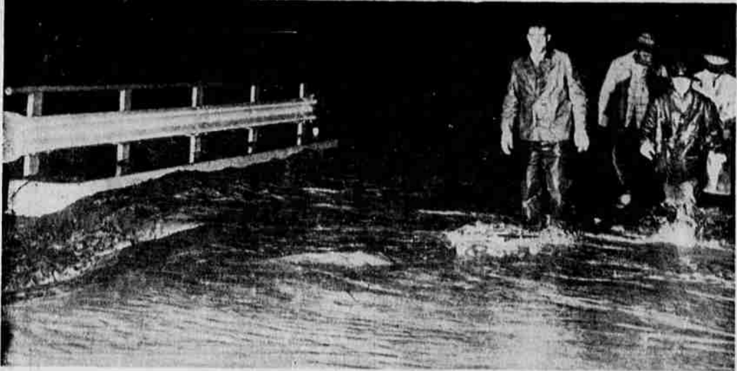
THE RAINS CAME—Thanksgiving day at Shady Dell, Ore., left residents very little to be thankful about as muddy waters from the Molalla river rose suddenly, flooding 27