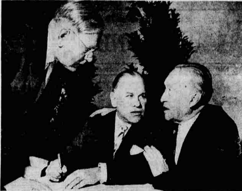
ELECTION PLANS ANNOUNCED — West German Chancellor Konrad Adenauer, right, is shown as he conferred with Eugen Gerstenmaier, center, president of the West German parliament, and Heinrich Krone, a leader of the ruling Christian Democratic party, at Bonn. Adenauer then addressed a party meeting to announce his plans for the forthcoming election campaign. In a meeting with U.S. officials, Adenauer was asked to take direct action to eliminate the U.S. dollar deficit in West Germany.