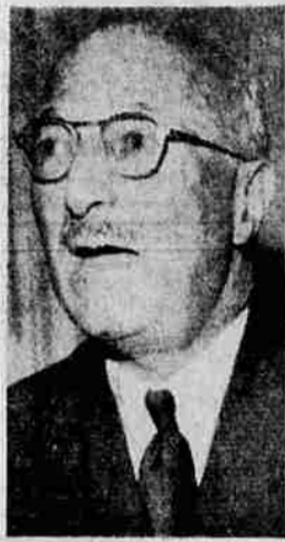
AMBASSADOR QUILTS —President Eisenhower has accepted the resignation of U. S. Ambassador to Italy James D. Eisenhower, above, who said he wanted to return to private life.

Winds blew down two 200-foot pipes which run from the planer mill to the burner. Wiring to the dry kiln also was torn down. Operation at the planer mill will not be resumed for the rest of the week but the dry kiln is expected to operate by Tuesday.