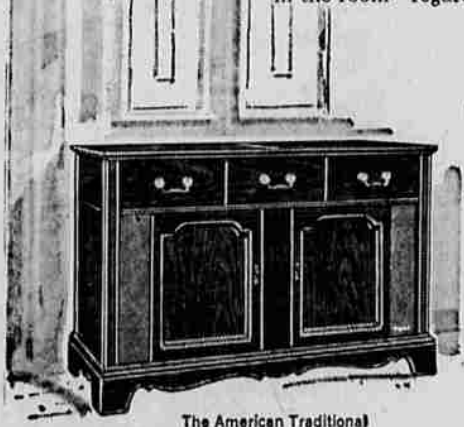
The American Traditional

We cordially invite you to come in and compare these magnificent new Magnavox instruments in beautiful fine furniture. They let you enjoy all the thrilling dimensional realism of stereo combined with the tonal purity of Magnavox high fidelity. Music truly becomes magic everywhere in the room—regardless of where you sit!