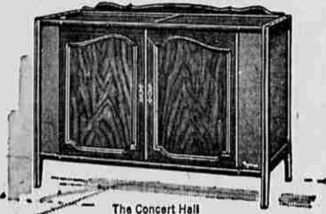
The Concert Hall

8-SPEAKER FM/AM RADIO-PHONOGRAPH... graceful fine furniture and superb stereo realism! Powerful stereo amplifier; 8-speaker system includes two 15" bass speakers, revolutionary new Magnavox Imperial Automatic Record Player with "Feather-Touch" Stereo Diamond Pick-up plays your records for a lifetime of normal use without perceptible wear of record or stylus. In Traditional or Contemporary styles. Four beautiful hand-rubbed finishes. Mahogany finish. $399.50