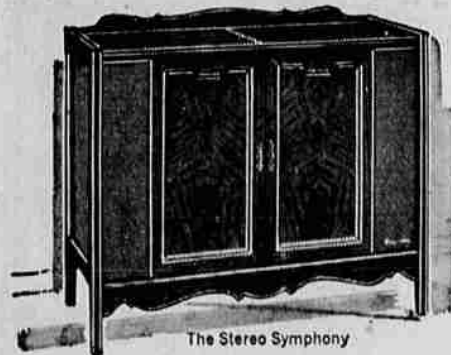
The Stereo Symphony

MODESTLY PRICED 6-SPEAKER PHONOGRAPH! Priced far below what you would expect to pay, this fine Magnavox lets you enjoy all the dimensional realism of stereo and tonal purity of Magnavox high fidelity. Six speakers including two 12" bass. Powerful stereo amplifier, Magnavox precision automatic record changer with Stereo Diamond Pick-up. Record library space. Several beautiful finishes. Traditional mahogany style shown, $265.00. Optional FM/AM radio, in Contemporary styling, only $249.50