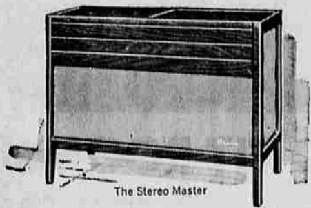
The Stereo Master

TRULY FINE STEREOGRAPHIC HIGH FIDELITY PHONOGRAPH PERFORMANCE AT EXTREMELY MODEST COST: Four Magnavox high fidelity speakers including two 12" bass. Magnavox precision automatic record changer with Stereo Diamond Pick-up. Powerful stereo amplifier. Acoustically perfected all-in-one beautiful compact cabinet in four hand-rubbed finishes. In mahogany, $179.50