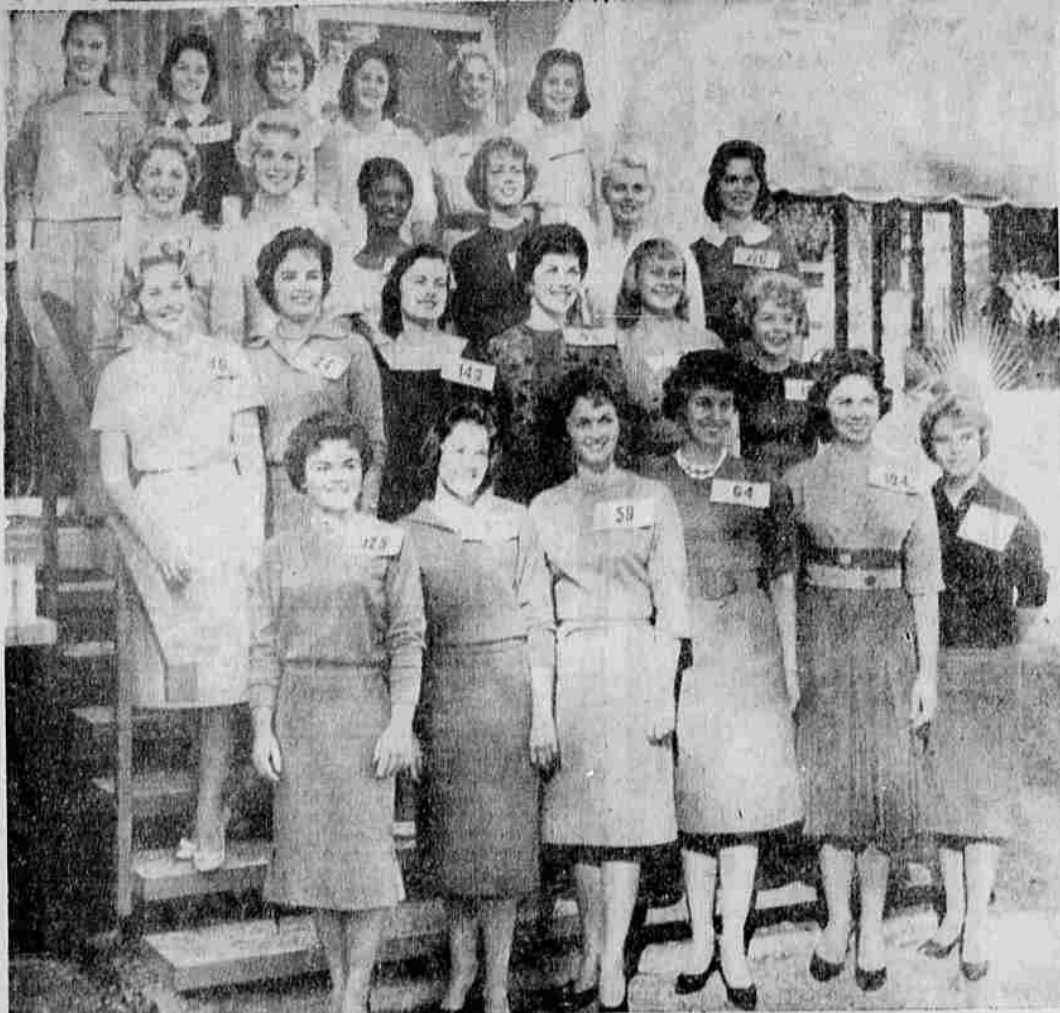
ROSE QUEEN CANDIDATES - Twenty-four girls who are still in the running for the title of Queen of the 72nd Tournament of Roses at Pasadena, Calif., on Jan. 1 pose for a group picture. The name of the girl who will rule over the New Year's tournament will be announced Nov. 30.