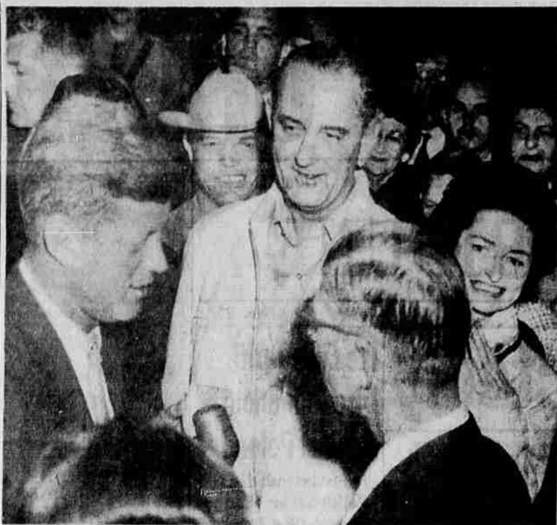
KENNEDY IN TEXAS —A casually dressed Lyndon B. Johnson, vice president-elect, talks with members of the press after his arrival at Johnson's ranch at Johnson City, Tex.