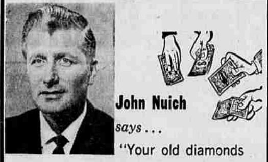
John Nuich says... "Your old diamonds are worth MONEY... REAL MONEY!"

The three women disappeared March 14 while on a hiking trip in the picturesque park, one of the most beautiful in Illinois. Two days later, their bodies were found lying side by side in the cave. All had been beaten to death.