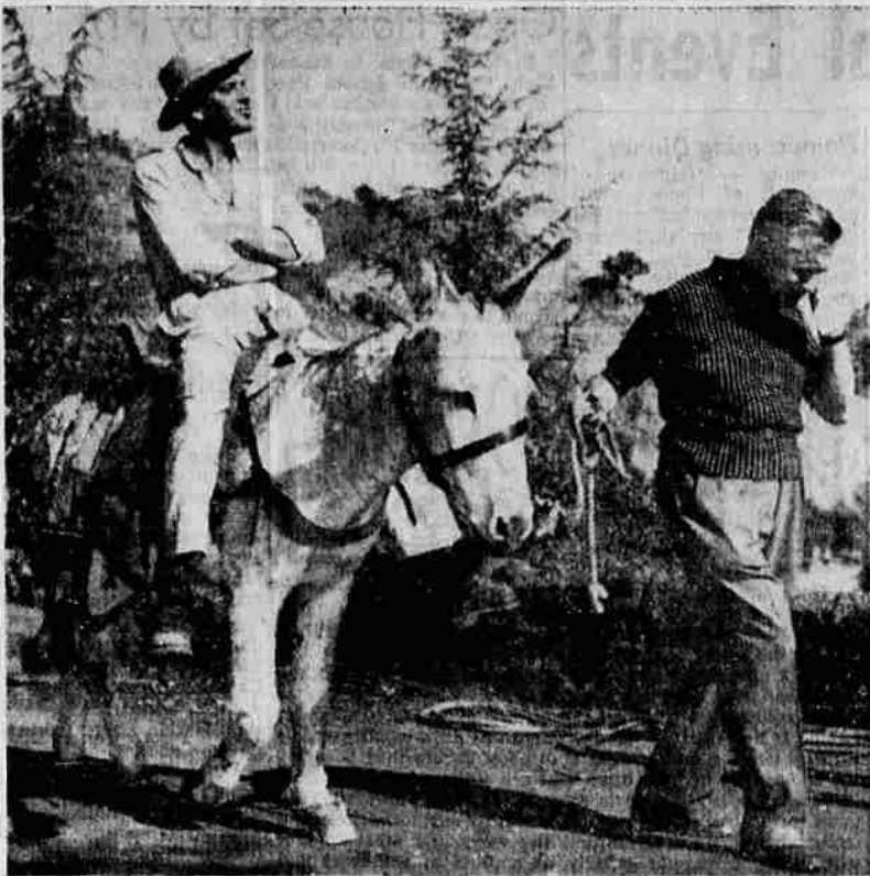
ELECTION BET PAID—Director Mervyn Leroy dries his tears as he leads a donkey carrying singer Frank Sinatra. Leroy, leader of the celebrities for Nixon committee, is paying off a bet he made with Sinatra on the outcome of the recent election. Sinatra is an ardent backer of President-elect Kennedy. The payoff occurred in Hollywood.

(Next week - Maj. Anderson takes command of Ft. Sumter.)