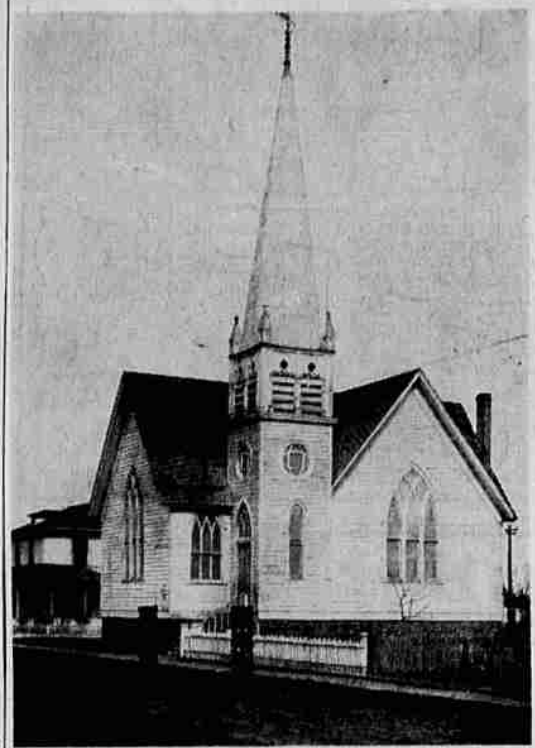
FIRST CHURCH —The First Methodist Episcopal church building was built at the corner of Bartlett and Fourth sts. It is currently used by the Salvation Army.