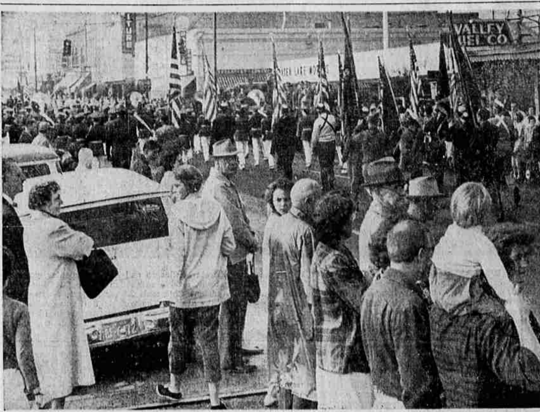
VETERANS PARADE—Thousands lined Main st. in Medford Friday to watch the Veterans' day parade. More than 45 units participated in the parade, one of the largest in Medford's history. The groups pictured above are passing the reviewing stand, under the watchful eye of retired Maj. Gen. William Dean, parade marshal. The McLoughlin Junior High school band is on the left. Carrying the flags are veterans of World Wars I and II.