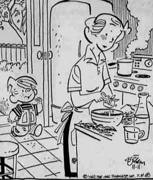
Mrs. Wilson is cookin' roast beef, 'tatoes 'n gravy, corn, an' apple pie! Can you top that? —E.A.