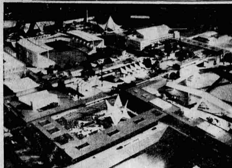
EXPOSITION PREVIEW —This model offers a preview of a proposed Century 21 Exposition planned by Washington state. The first international exposition to be held in the United States since 1939, the Century 21 display is expected to attract some 10 million people to view its space age exhibits from April 21 to Oct. 21, 1962.