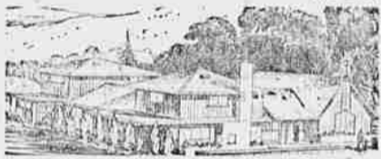
Ashland's Leading Funeral Director Since 1935

Highway 66 at Normal Ave. Ashland — Dial MU 5-4541