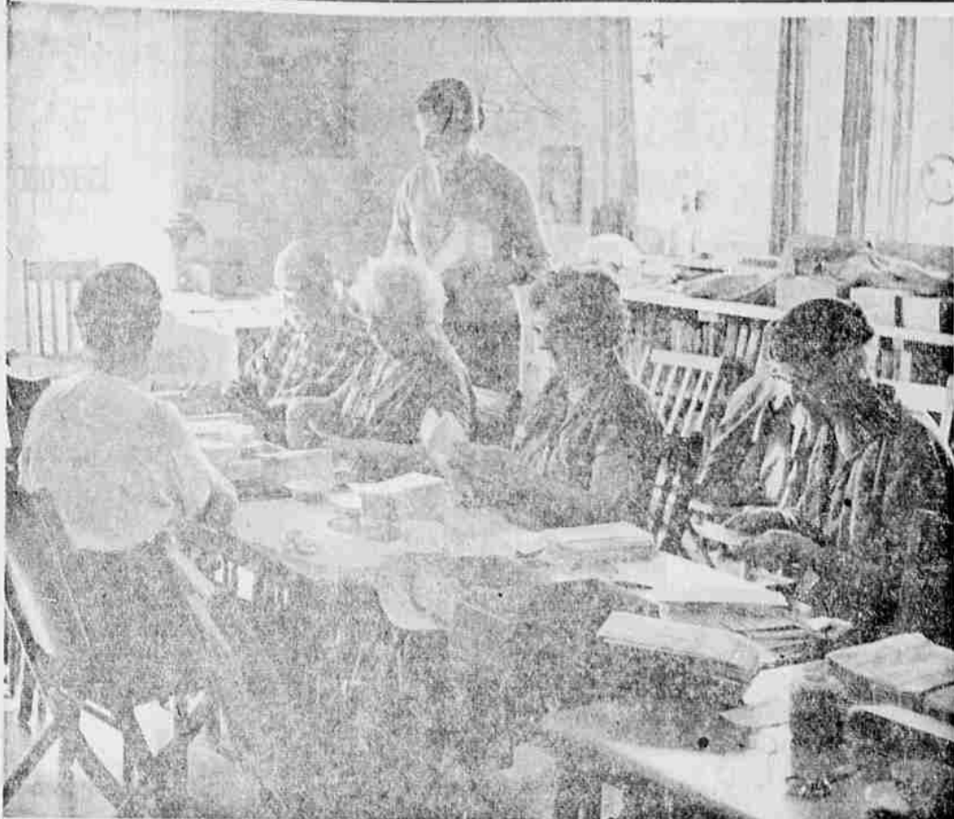
VOLUNTEERS —Members of the Medford 50-Plus club are shown above as they stuffed and sealed envelopes recently for the forthcoming Tuberculosis and Health association Christmas seal campaign that will start Nov. 14. Helping them, and overseeing the operation at the Senior Activity