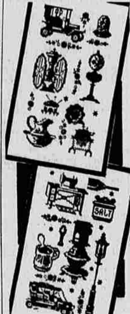
7428 by Alice Brooks

For antique lovers! Add a quaint 'n' colorful touch with this pair of charming samplers. Gay Victorian treasures — fun and easy to embroider in 8-to-10 inch cross-stitch; lazy daisy accent. Pattern 7428; two 8 1/2 x 18-inch transfers; color schemes. Send Thirty-five cents (coins) for this pattern — add 10 cents for each pattern for 1st-class mailing. Send to Medford Mail Tribune, Household Arts Dept., P.O. Box 168, Old Chelsea Station, New York 11, N. Y. Print plainly NAME, ADDRESS, PATTERN NUMBER. JUST OUT! Our 1961 Needlecraft Book. Over 125 designs for home furnishings, for fashions — knit, crochet, embroider, weave, sew, quilt — toys, gifts, bazaar items. FREE — six designs for popular veil caps. Quick — send 25 cents TODAY.