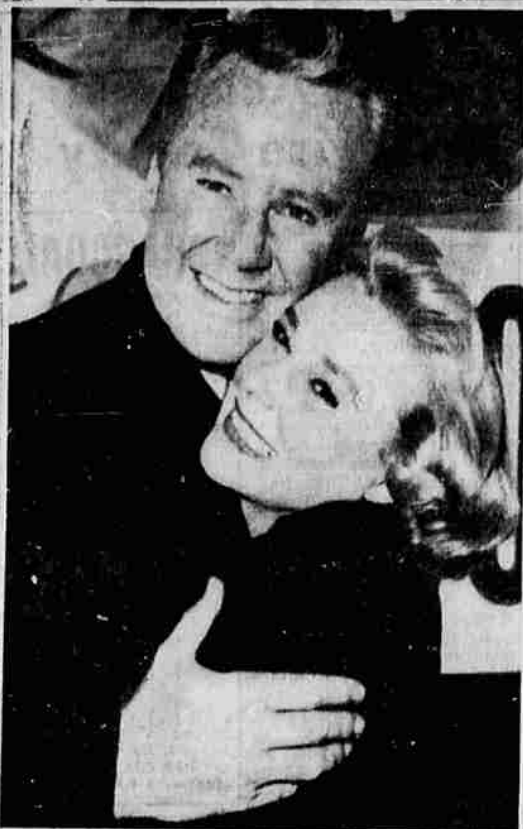
REUNITED ON TV - Van Johnson and June Allyson who were teamed in nine movies starting back in 1942, are reunited as they appear together on television.