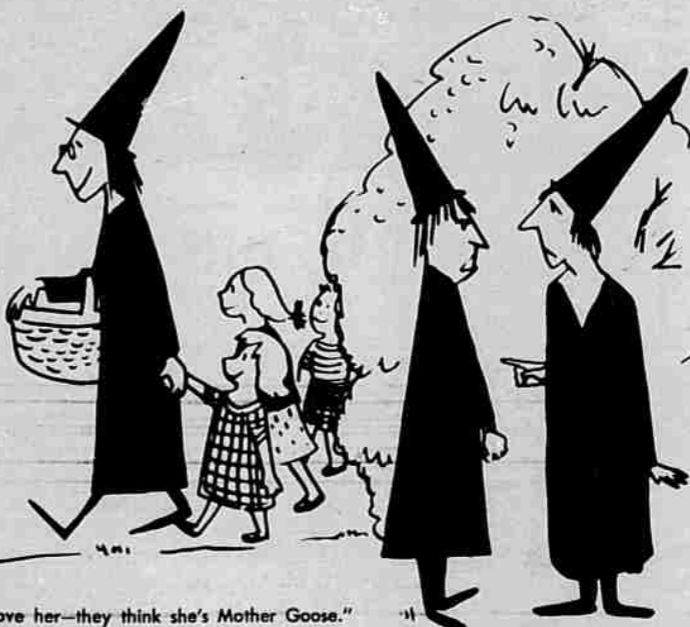
"Children love her—they think she's Mother Goose."

In any event, keep your wits about you if you attend a Halloween party. Some of the spirits surrounding you will be good and some evil. We hope you can spot which is witch!