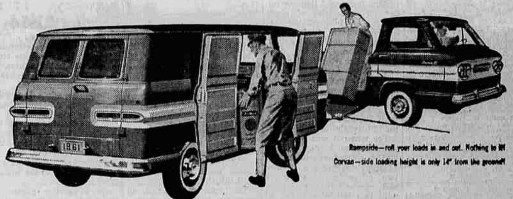
Rampside—roll your loads in and out. Nothing to lift! Corvair—side loading height is only 14" from the ground!

2 TOTALLY DIFFERENT TYPES OF CHEVY TRUCKS!