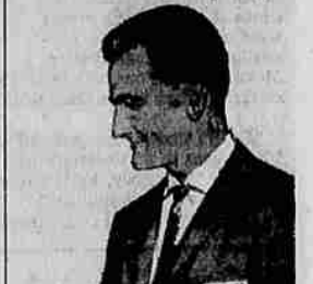
LOW COST OF GOVERNMENT

Secretary of State Appling took office for the sake of the people - not politics. His new rehabilitation programs for state institutions enable countless lives to be happier, more useful, less drain on your tax dollar.