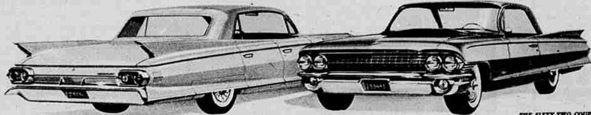
THE FLEETWOOD SIXTY SPECIAL