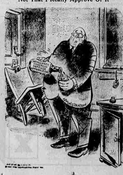
"Not That I Really Approve Of It"