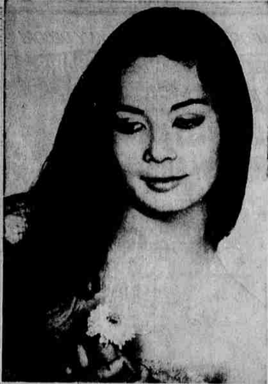
THE FULL TREATMENT — Half-Chinese, half-Scottish-Irish Nancy Kwan is getting the full treatment publicity build-up by studio press agents in connection with her first motion picture role. Her candid answers during interviews with the press have sent several members of the studio publicity departments scurrying for their ulcer pills.