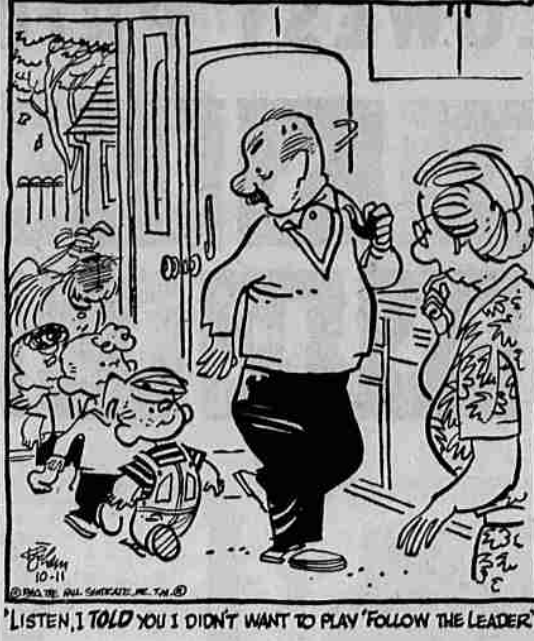
'LISTEN, I TOLD YOU I DIDN'T WANT TO PLAY 'FOLLOW THE LEADER!'