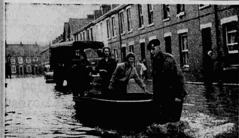
HOUSEWIVES RESCUED —Royal Marines came to the rescue of stranded housewives with a collapsible dinghy in a flooded street in Exmouth, England. Residents were still cleaning up the town following a previous flood when waters came back. The flood was touched off by more than eight inches of rain within a week, causing rivers to burst their banks and disrupt all power services. At least three persons died in the deluge which ravaged western Britain for the third time in 10 days.