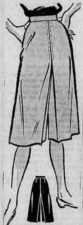
9359 WAIST 24"-34" by Marian Martin

CULOTTES — newest city-country-campus fashion! They look like a pleated skirt but have all the easy-stepping advantages of pants. Easy-sew, so smart. Printed Pattern 9359: Misses' Waist Sizes 24, 26, 28, 30, 32, 34. Size 28 takes 2 1/4 yards 54-inch fabric. Send THIRTY-FIVE CENTS (coins) for this pattern — add 10 cents for each pattern for first-class mailing. Send to Marian Martin, Medford Mail Tribune, Pattern Dept., 232 West 18th St., New York 11, N.Y. Print plainly NAME, ADDRESS with SIZE and STYLE NUMBER. New! Send now for our 1960 Fall and Winter Pattern Catalog — every page in exciting color! Over 100 styles for all sizes, all occasions plus school . . . 35c.