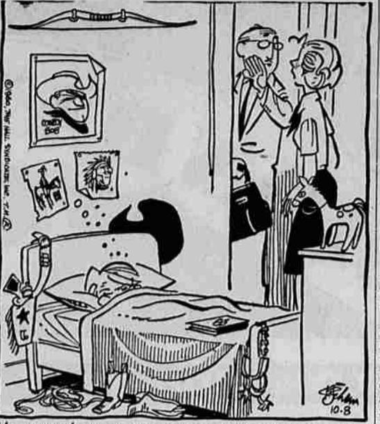
ACTUALLY, IT'S JUST A HEAD COLD, BUT YOU MIGHT GET MORE COOPERATION FROM HIM IF YOU SAY IT'S SADDLE FEVER.

IS KENNEDY BREAKING THROUGH? En Route with Kennedy - On the eve of the second nationwide television debate, the signs suggest that Sen. John F. Kennedy's Presidential campaign is close to achieving the kind of major breakthrough which is usually decisive.