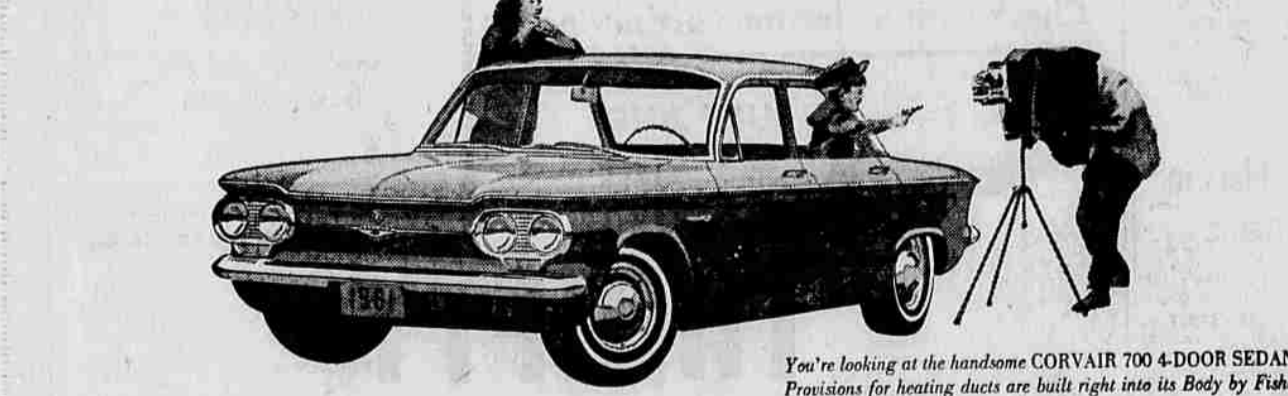
You're looking at the handsome CORVAIR 700 4-DOOR SEDAN. Provisions for heating ducts are built right into its Body by Fisher for more equal distribution of heat front and rear.

And our new wagons? You'll love them—think they're the greatest thing for families since houses. The Lakewood Station Wagon does a man-sized job with cargo, up to 68 cubic feet of it. The Greenbrier Sports Wagon you're going to have to see—it gives you up to 175.5 cubic feet of space for you and your things. Compare that with any other U.S. wagon going! Corvair's whole thrifty lineup gets its pep from a spunkier 145-cu.-in. air-cooled rear engine. Same rear-engine traction, same smooth 4-wheel independent suspension ride. See the polished and refined 1961 Corvair first chance you get at your Chevrolet dealer's.