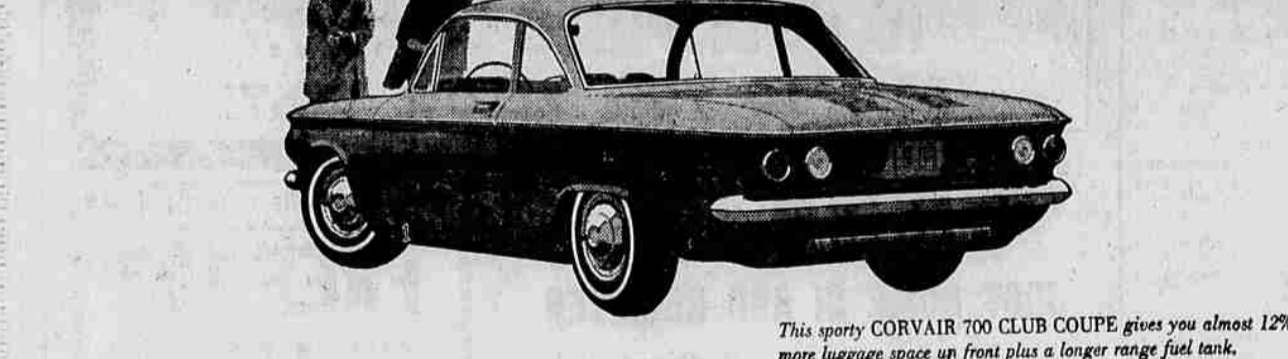
This sporty CORVAIR 700 CLUB COUPE gives you almost 12% more luggage space up front plus a longer range fuel tank.

More room—more for you, more for your things. More dependable operation. Smarter, smoother styling. More miles per gallon. Wagons. Corvair for '61: a complete line of complete thrift cars from Chevrolet. To start with, every Corvair has a budget-pleasing price tag. And Corvair goes on from there to save you even more. With extra miles per gallon... quicker-than-ever cold-start warmup so you start saving sooner... a new extra-cool optional heater that warms everybody evenly. Riding along with this extra economy: more room inside for you, more room up front for your luggage (sedans and coupes have almost 12% more usable trunk space).