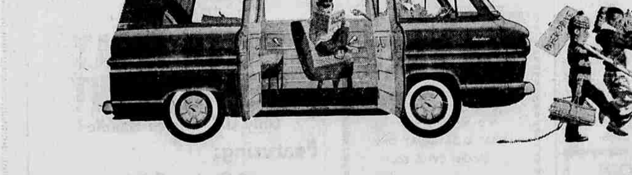
Now in production—the GREENBRIER SPORTS WAGON with up to twice as much room for people and things as ordinary wagons (shown with optional extra-cost third seat in position).

Corvair's whole thrifty lineup gets its pep from a spunkier 145-cu.-in. air-cooled rear engine. Same rear-engine traction, same smooth 4-wheel independent suspension ride. See the polished and refined 1961 Corvair first chance you get at your Chevrolet dealer's.