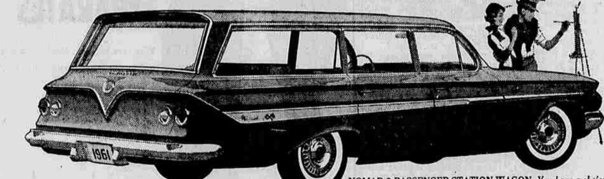
NOMAD 9-PASSENGER STATION WAGON. You have a choice of six Chevrolet wagons, each with a cargo opening nearly 5 feet across and a new concealed compartment for storing valuables.

We started out by trimming the outside size a bit (to give you extra inches of clearance for parking and maneuvering) but inside we left you a full measure of Chevy comfort. Door openings are as much as 6 inches wider to give feet, knees and elbows the undisputed right of way. And the new easy-chair seats are as much as 14% higher—just right for seeing, just right for sitting. Once you've settled inside you'll have high and wide praises for Chevrolet's spacious new dimensions (in the Sport Coupes, for example, head room has been upped as much as 2 inches, and there's more leg room, too—front and rear). Chevy's new trunk is something else that will please you hugely—what with its deep-well shape and bumper-level loading it holds things you've never been able to get in a trunk before.