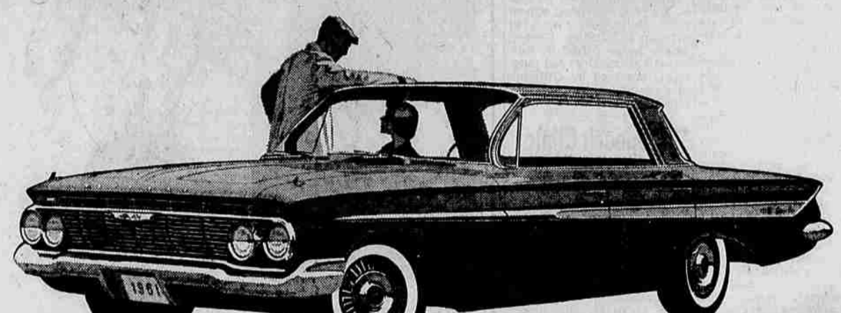
IMPALA 4-DOOR SPORT SEDAN—one of five Impalas that bring you a new measure of elegance from the most elegant Chevies of all. Notice what beautiful view the new roof line makes—the front door entrance height is nearly 2 inches higher.

Here's the car that reads you loud and clear—the new size, you-size '61 Chevrolet. A car so right for you in so many ways that once you compare it with the rest of the crop you'll agree nothing else near the money measures up to it.