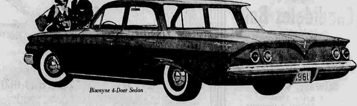
Biscayne 4-Door Sedan

the lowest priced full-sized Chevy with big-car comfort at small-car prices! Now you don't have to go without style, space and one of the world's best rides to get a car that's low priced and economical to drive. Chevy's new '61 Biscaynes—6 or V8—give you a full measure of Chevrolet quality, roominess and proved performance—yet they're priced down with many cars that give you a lot less!