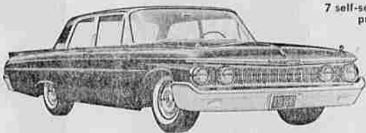
1961 MERCURY METEOR 600

First low-price car with a fine-car ride. Exclusive Cushion-Link suspension!