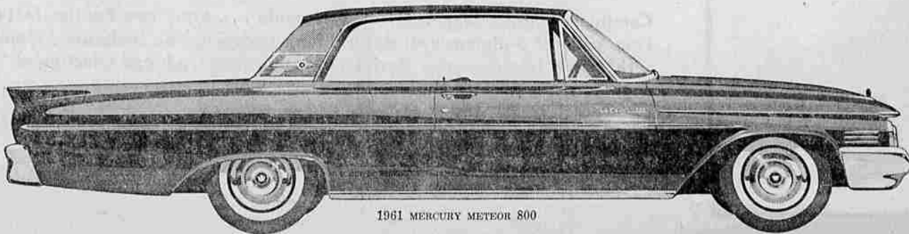
1961 MERCURY METEOR 800