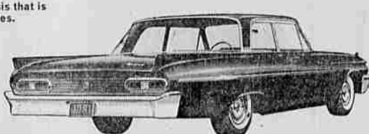
1961 MERCURY METEOR 600