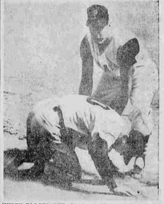
KUBEK TAGGED OUT —Pittsburgh Pirate second baseman Bill Mazeroski tags out Tony Kubek of the Yankees in the first inning after Hector Lopez hit into a double play in the first game of the World Series at Forbes Field in Pittsburgh. The Pirates won, 6 to 4.

Pirates seventh: Duren went in to pitch for the Yankees. Skinner was hit by a pitch. Stuart struck out. Clemente fouled out. Burgess grounded out. No runs, no hits, no errors, one left.