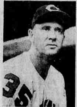
GORDON RESIGNS—Joe Gordon resigned today as manager of the Detroit Tigers of the American league.