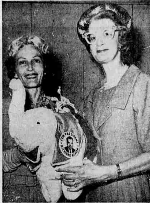
POLITICIANS' WIVES - Mrs. Richard Nixon, left, wife of the GOP presidential candidate, and Mrs. Nelson Rockefeller, wife of the New York governor, share center stage with an elephant - a Republican model - at a meeting in New York City. The Nixons are making a whirlwind tour of the area.